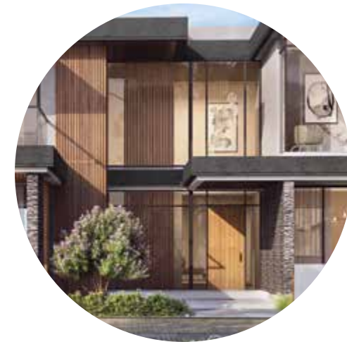
IMPRESSIVE DOUBLE HEIGHT ENTRANCE