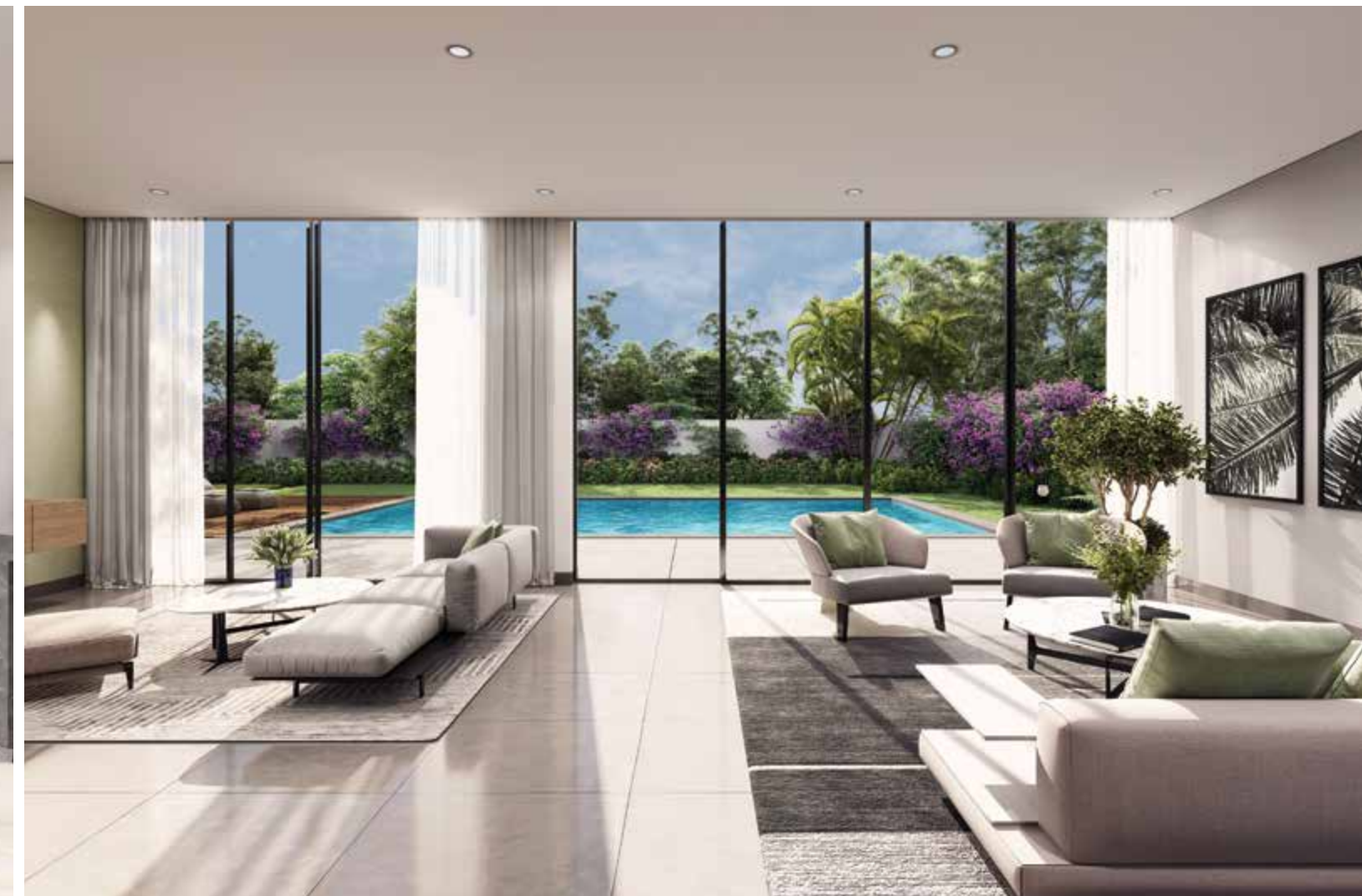
AMARA 5-BEDROOM EXCLUSIVE ISLAND VILLAS