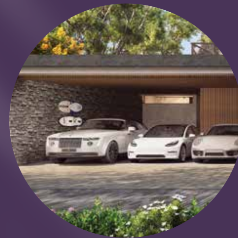
GENEROUS GARAGE SPACE