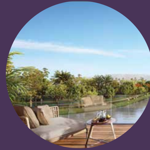
STUNNING WATER VIEWS