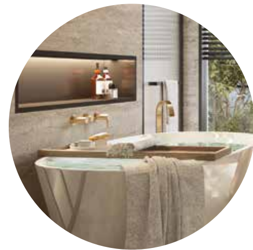
SPA-STYLE EN SUITES