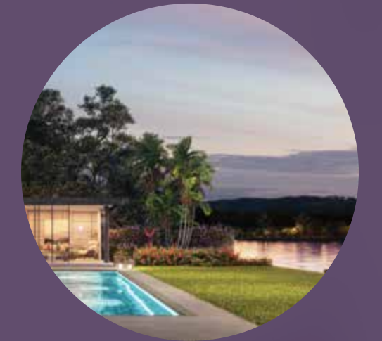
LARGE PRIVATE PLOTS