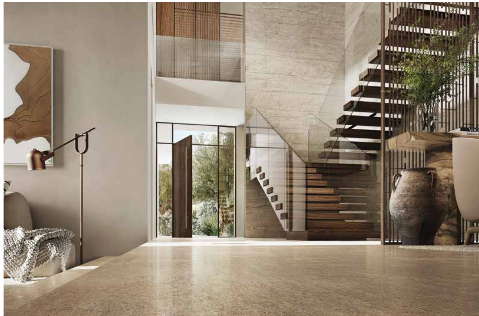
ALAYA 6-BEDROOM GRAND ISLAND VILLAS