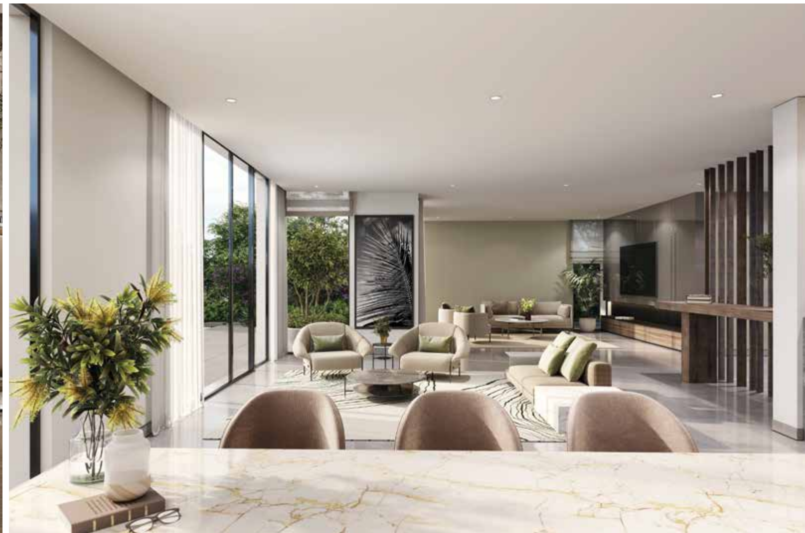
AYANA 6-BEDROOM SERENE ISLAND VILLAS