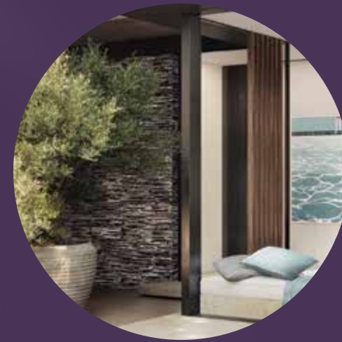
OUTDOOR MAJILIS AND COURTYARDS