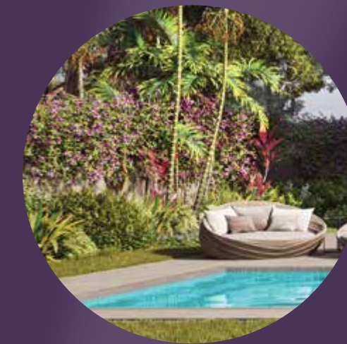
LANDSCAPED GARDEN OPTION