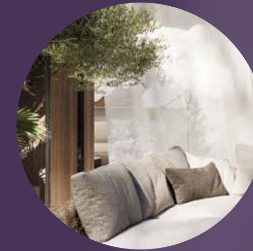
SHADED TERRACES AND BALCONIES