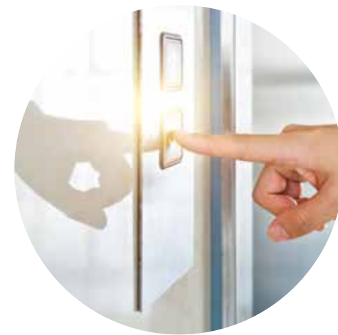
HOME ELEVATORS IN EACH GRAND VILLA