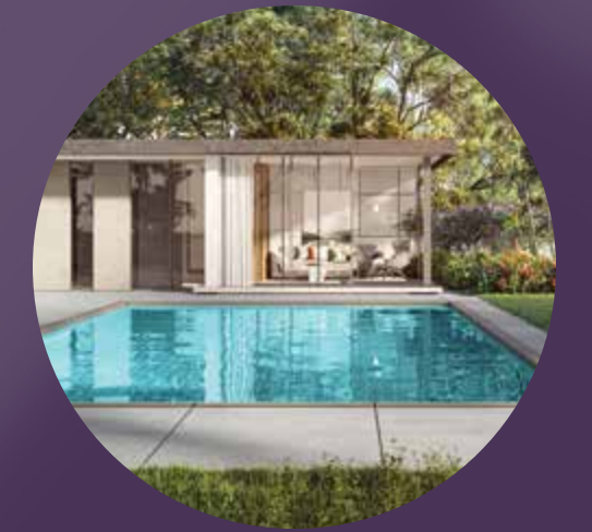
PRIVATE POOL OPTIONS