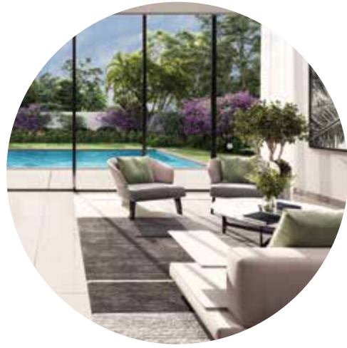
OPEN PLAN LIVING